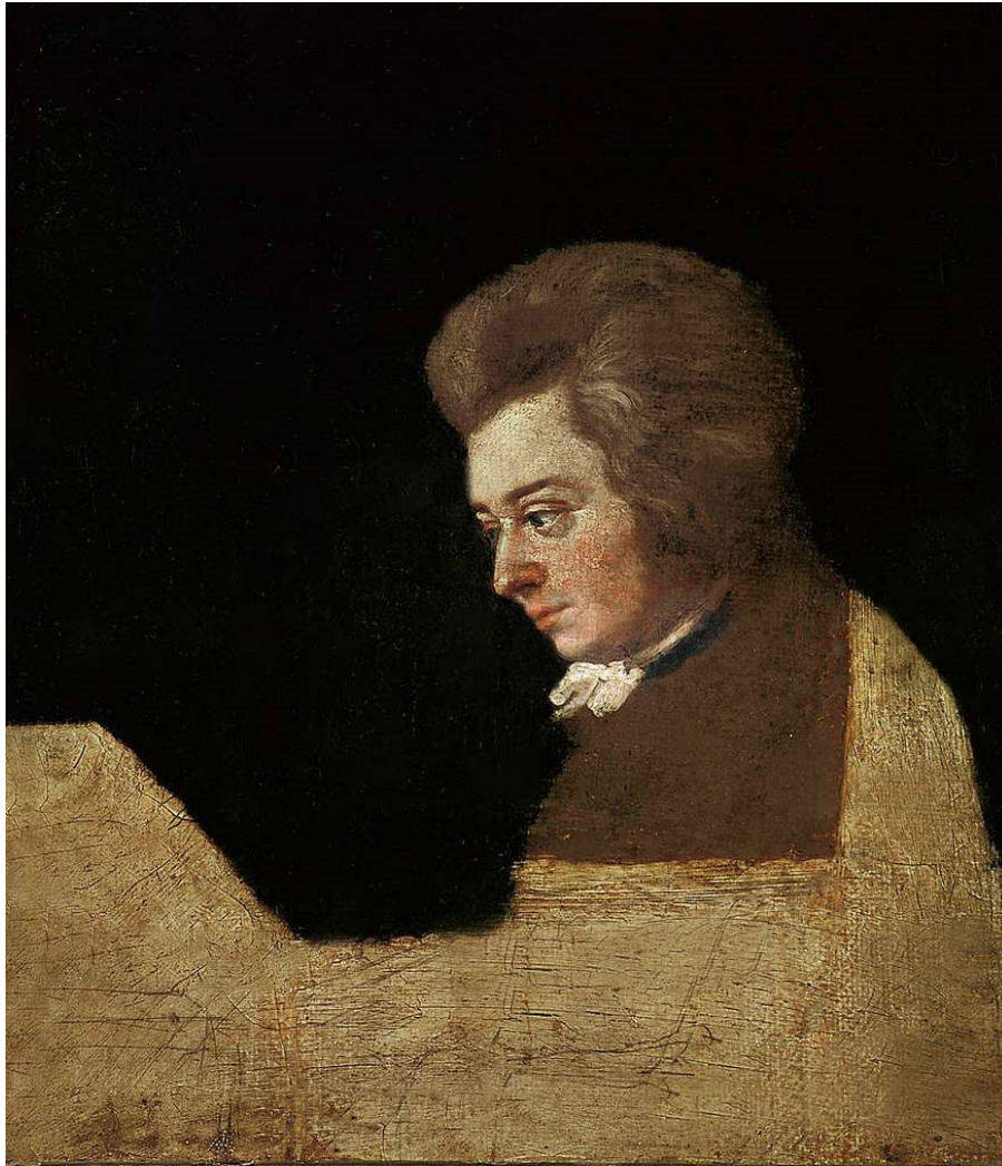
Unfinished portrait of Wolfgang Amadeus Mozart at the Piano at the age of 26 (1782) by Joseph Lange