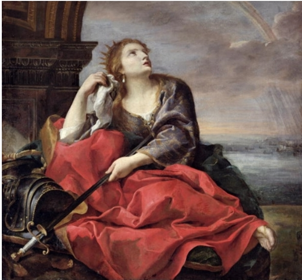
Andrea Sacchi - The Death of Dido - 17th c